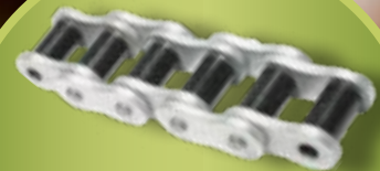
Standard & solution transmission chains